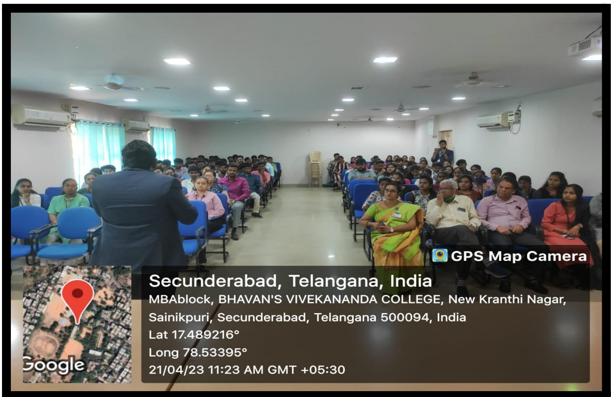
Speaker explaining about the significance of entrepreneurship to students of MBA 1 st year.