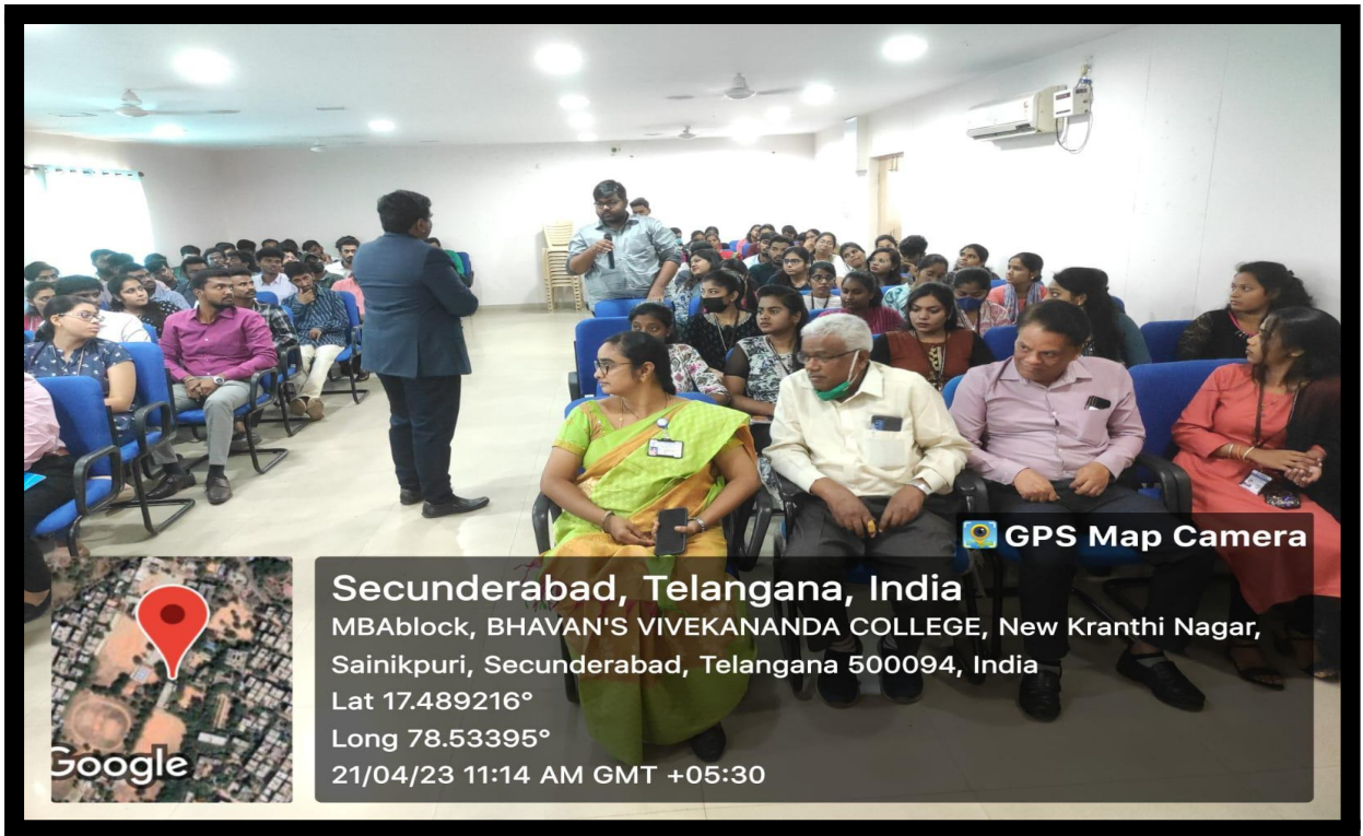
Students interacting with the speaker regarding Liberalization , privatization and globalization(LPG) in India.