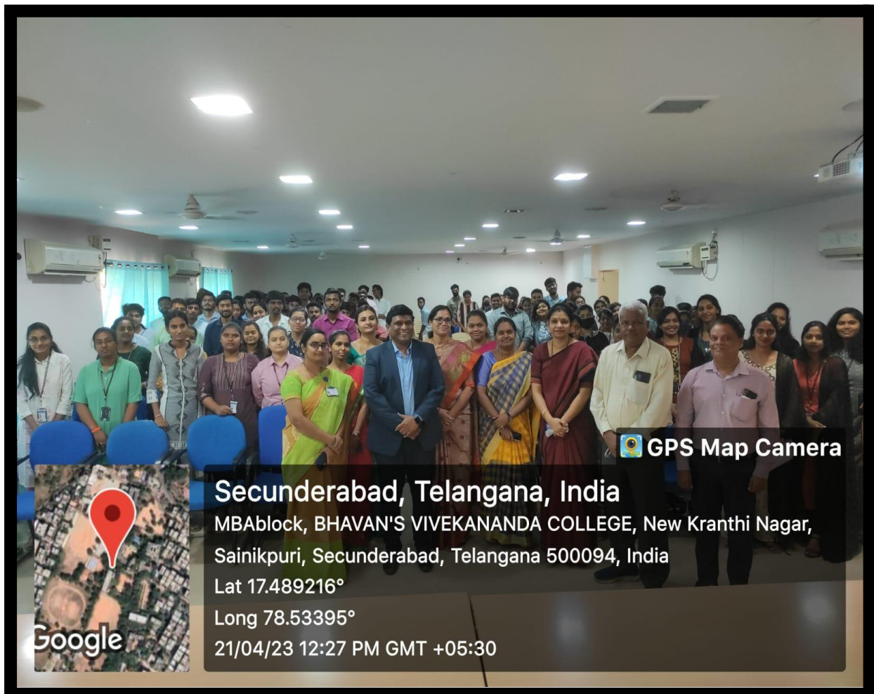
Speaker with Faculty of department of management studies and students of MBA 1 st year.

He inspired students with his personal story from a small family background to founder and CEO of Ealkay consulting with his spouse at the age of 40. He believed in hard work, honesty, transparency to reach such a position in a short span of time. He also became director at the age of 34 and CFO at the age of 38 with the objective to share the experience and knowledge to the corporate and business community. The speaker concluded the session by taking photos with the students and faculty.